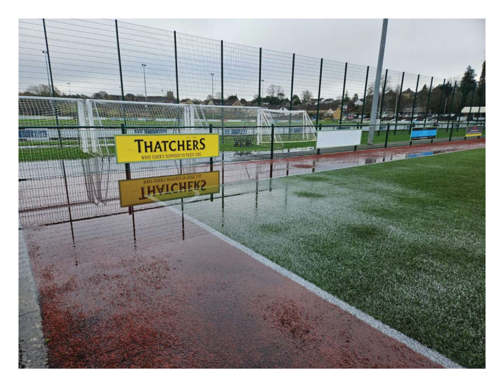
WHY THE GAME WAS CALLED OFF LAST WEEK!