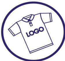
Work & Leisurewear

Stockwood Vale, Keynsham, Bristol, BS31 2AL