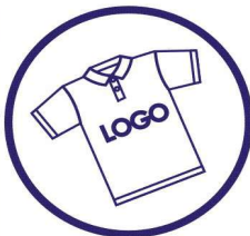
Work & Leisurewear

Stockwood Vale, Keynsham, Bristol, BS31 2AL