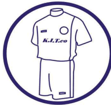
Sportswear & Equipment