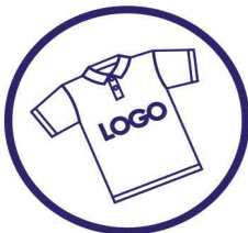
Work & Leisurewear

Stockwood Vale, Keynsham, Bristol, BS31 2AL