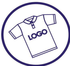
Work & Leisurewear

Stockwood Vale, Keynsham, Bristol, BS31 2AL