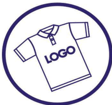
Work & Leisurewear

Stockwood Vale, Keynsham, Bristol, BS31 2AL