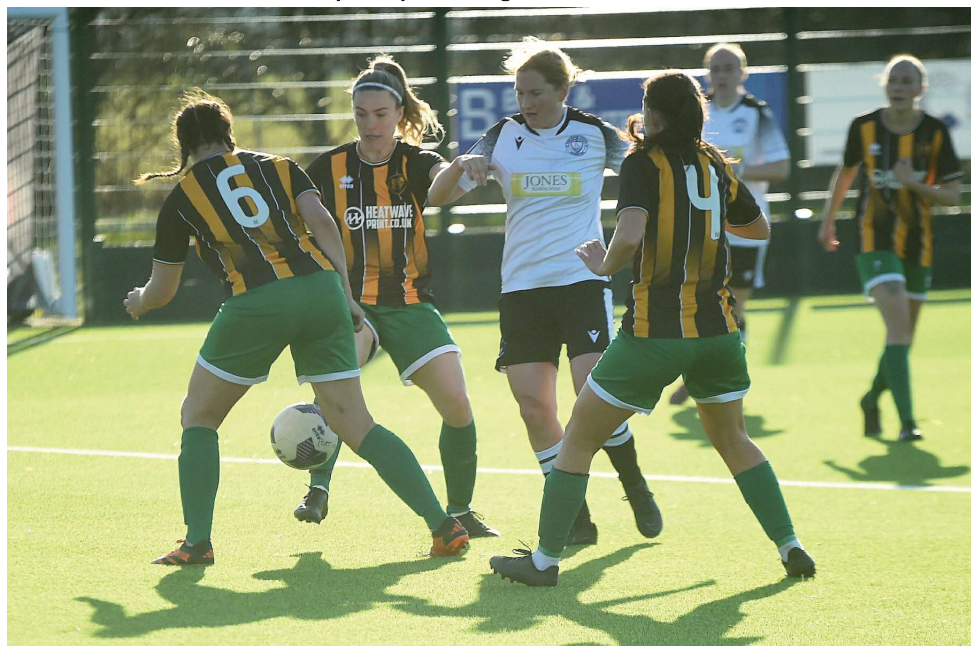
Bournemouth Sports defend in depth against Portishead Town last weekend (Photo - Women's Soccer Scene).

Players of all abilities aged 16+ are welcome to join the team and are invited to get in contact. The team have multiple contacts with other local clubs in the area if the level is not suitable. Aspirations for the club are to continue to climb the womens football pyramid and to continue to increase female participation in grassroots football.