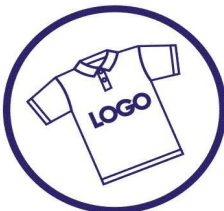
Work & Leisurewear

Stockwood Vale, Keynsham, Bristol, BS31 2AL