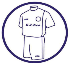
Sportswear & Equipment