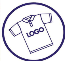
Work & Leisurewear

Stockwood Vale, Keynsham, Bristol, BS31 2AL