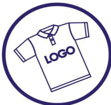
Work & Leisurewear

Stockwood Vale, Keynsham, Bristol, BS31 2AL